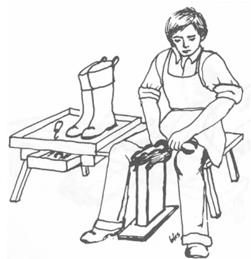
Shoemaking & Repair