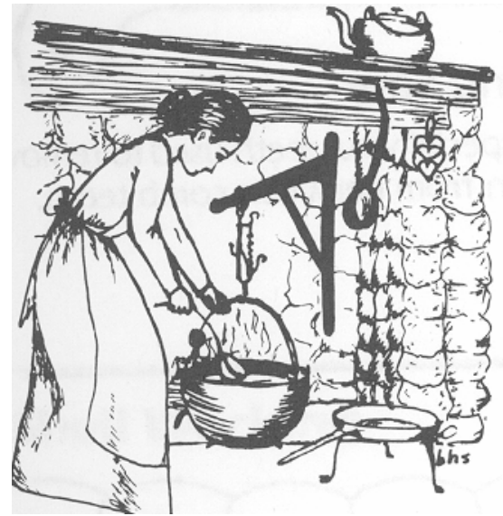
Cooking Over a Fire