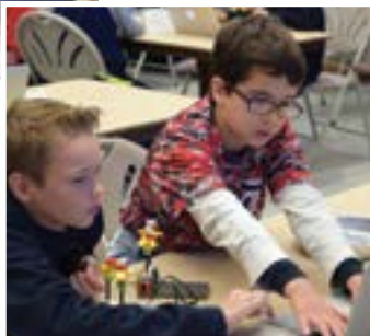
Top: First Place Winner, Senior Individual Exhibits, Bucks-Mont Regional History Day 2015