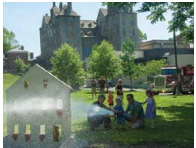
Family Enjoys Firefighting “Muster” Event on the Mercer Grounds