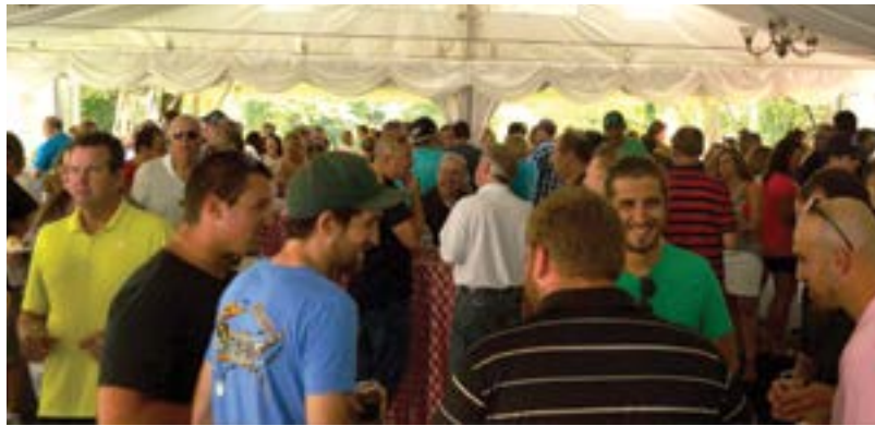
Crowd gathers at Fonthill Castle Beer Fest