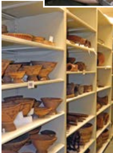
Mercer Collections Move and Storage Improvement Project