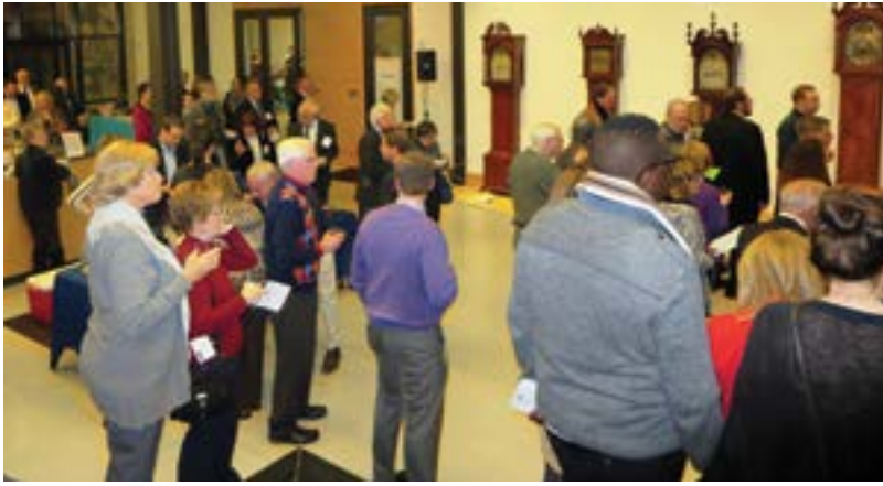
Members and sponsors attend House & Home exhibit preview event