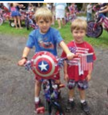
Fonthill's annual Old-Fashioned 4th of July is enjoyed by all ages.

Beyond our programs and events, vital preservation and restoration work was launched and/or completed. The Gatepost on North Street was restored with funds raised by Quester groups and others; this is the first of the gate posts to be completed. Also with local Quester group funds a historic reproduction of the curtain in the Terrace Room was installed. A Collections intern, following established methodology, worked to reattach tiles that had fallen off walls. This project is ongoing.