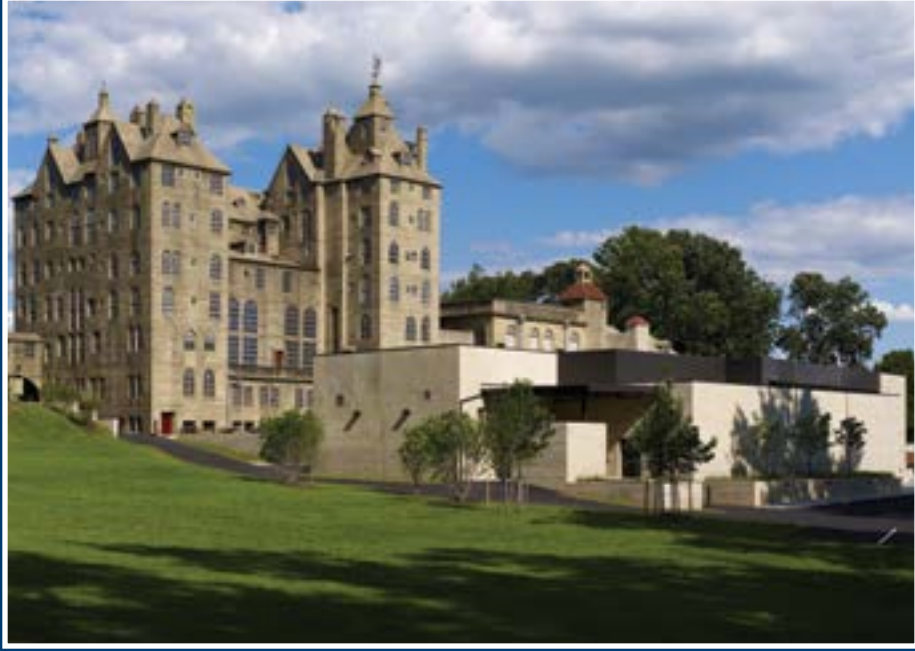
Mercer Museum & Library