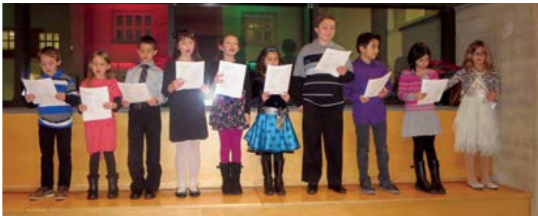
Young performers entertain at Mercer Museum's Holiday Open House