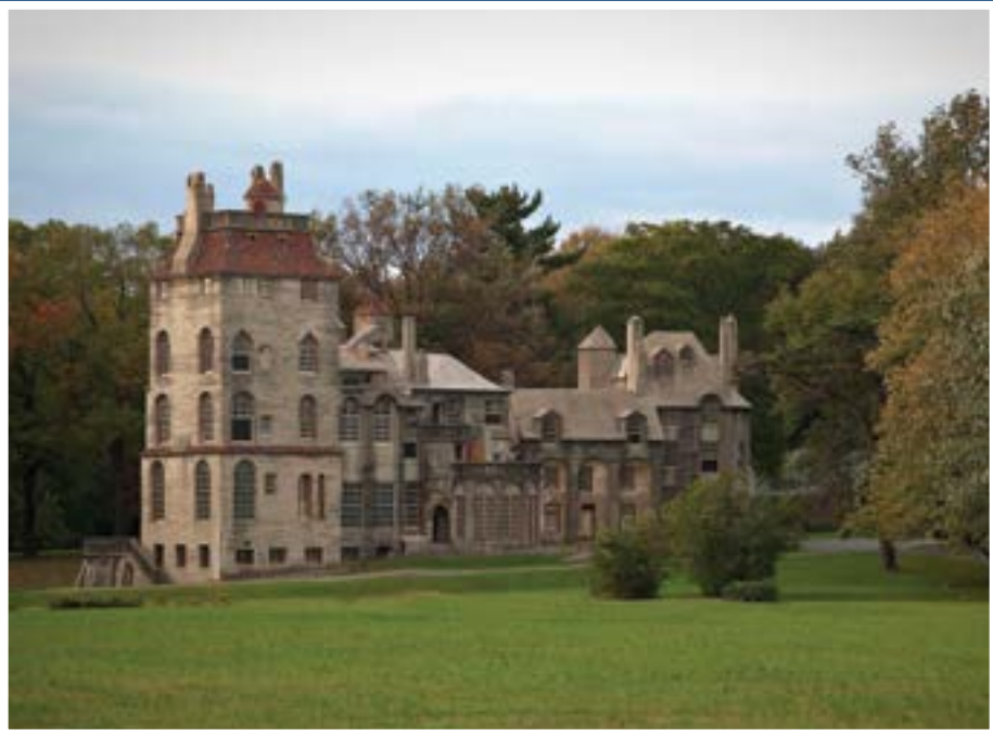
Fonthill Castle