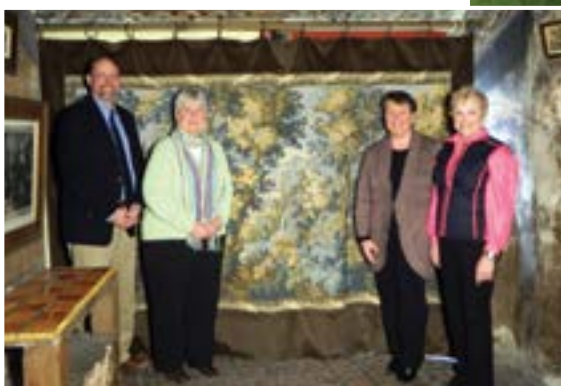
Left: Fonthill's Terrace Room reproduction drapes unveiled.