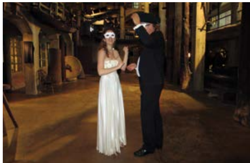
Dashboard Hula Girls film their music video for "Mr. Bluebird"