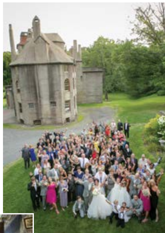
Above: Wedding guests enjoy the setting of Fonthill for the couple's special day.