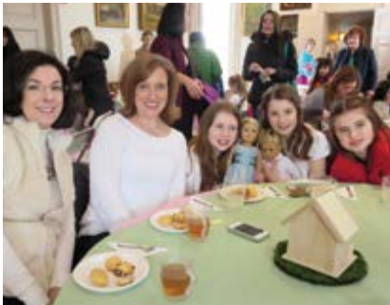
Families enjoy tea time and fashion show at Doll's Day Out.