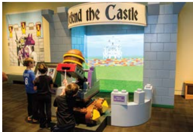
Kids enjoy interactive LEGO® catapult