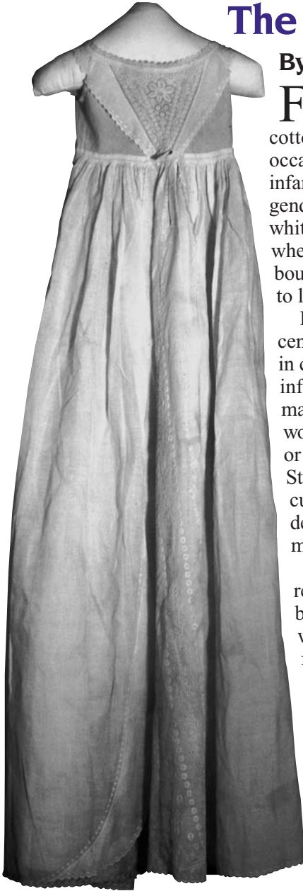
From the Mercer Museum's collection, 98.00.318, circa 1850-1860. This dress is an example of Ayrshire embroidery.

For approximately 150 years, from around 1790 to 1940, long white cotton dresses were everyday and special occasion garments for both male and female infants of middle and upper class families. The gender-neutral dresses were indeed the “small white uniform” of their time. These dresses, whether lovingly handmade or expensively bought, were treasured and often handed down to later generations.