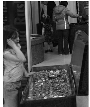
The Hunt for Treasure. Visitors enjoy a previous installation of this engaging traveling exhibit, on view at the Mercer through September 21.

Currently on view at the Mercer Museum is the traveling exhibit, The Hunt for Treasure! Developed by NRG! Exhibits, this highly engaging and interactive family exhibit features four themed areas: sunken treasure, buried treasure, detecting treasure and the modern treasure hunt. Through video and hands-on components, visitors will experiment with metal detectors, take part in a treasure hunt game, learn how underwater remote operated vehicles (ROVs) operate, try their hands at safe-cracking, and hoist a pirate flag.