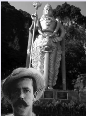
Traveling Henry in Malaysia

That's right, where has Henry been lately? Traveling Henry has been traveling all over the globe this past year. His travels outside of the U.S. have taken him to Machu Picchu, Malta, Kenya, Beijing, Malaysia, Barcelona and Prague. Henry has also been trekking about the U.S. in Oregon, Colorado, Florida, Maine, Minnesota, and New York City. If you would like to take a Traveling Henry with you on one of your upcoming excursions please contact us at mmeduc@mercermuseum.org . We will be happy to prepare Henry for a new adventure. Just make sure you take a photo of Henry on the trip. Join our Facebook page to get access to rarely seen photos, event updates, interesting and intriguing museum information AND to keep up with Henry's many world explorations.