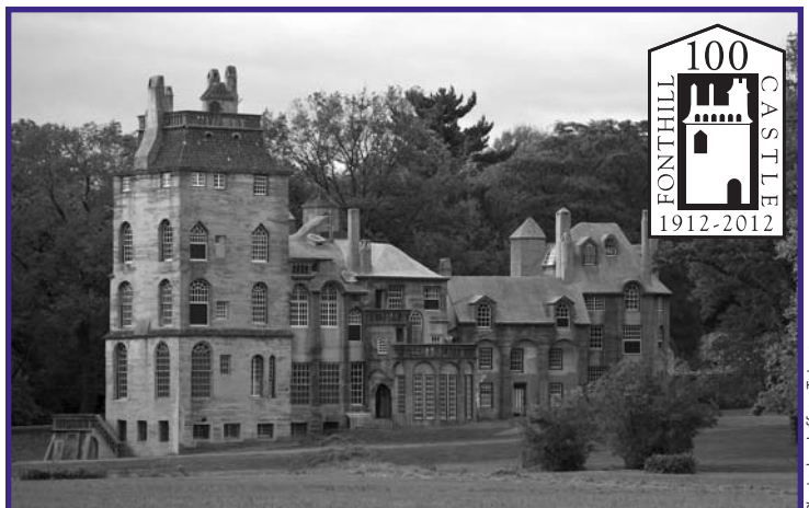
Fonthill Castle celebrating 100 years in 2012