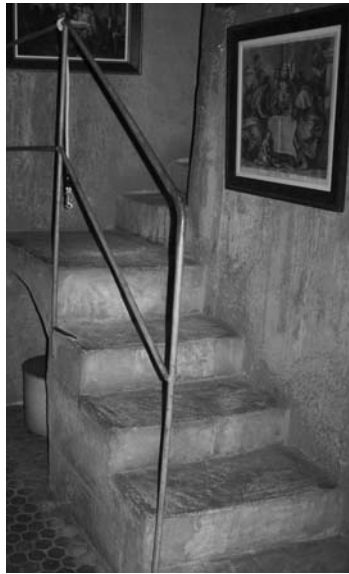
This railing in the Gallery is fabricated from 3/4" iron pipe that Mercer used throughout Fonthill.

First, the exhaustively complete house bills for Fonthill, carefully preserved and meticulously entered into a ledger by Frank Swain, Mercer's assistant, reveal the people who created or sold the building's hardware. 2 Four different