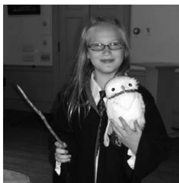
The Wild World of Wizing Camp

If you are familiar with the Harry Potter book series and the now famous Hogwart's School of Witchcraft and Wizardry, then you will find the tale behind the premier American School of Wizardry, The Wild World of Wizing School at the Mercer Museum, absolutely fascinating! It was founded almost 100 years ago by an American wizard you may all recognize: Henry Chapman Mercer. It is a little known story to most Doylestown residents that Mercer spent his life traveling the world collecting many ancient, dangerous, and magical artifacts. To secure these arti-