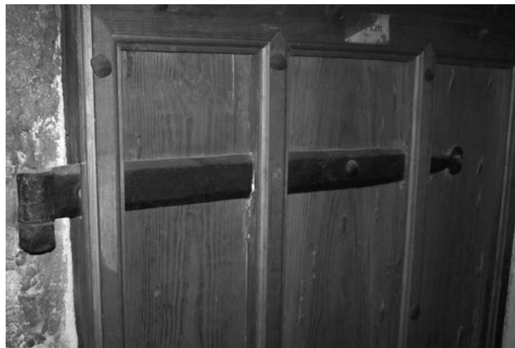
INTERIOR FINISHING: DOOR DETAIL

etc., in the house are of modern French make and have greatly faded. Most of the prints (engravings) were obtained from George H. Rigby, the bookseller in Philadelphia. The picture frames were generally adapted from old mirror frames of about 1840, and they and the furniture painted to give color to the room. The floors were polished with damp white pine sawdust slightly oiled with boiled linseed oil.