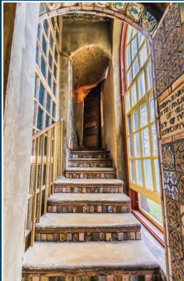
Fonthill Castle's extraordinary Yellow Room stairway