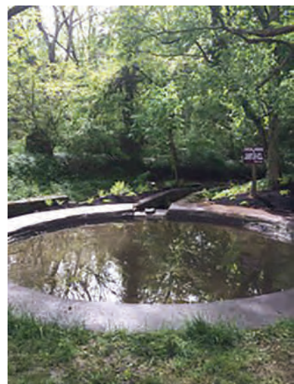
Fonthill's reflection pond after completed clean up

Fonthill worked in partnership with the Friends of the Bucks County Historical Society to present the Second Annual Kite Day celebration, which drew over 200 participants. An alliance with the Village Improvement Association (VIA) resulted in a special Homes for the Holidays tour, showcasing both Fonthill and the James Lorah Memorial House for guests to explore. Advancing the tradition of collaborations, staff worked with a local Venturing Crew to complete beautification and clean-up efforts of Fonthill's reflection pool area.