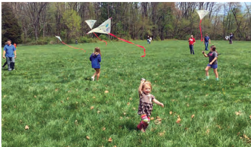
Youngsters enjoy kite flying