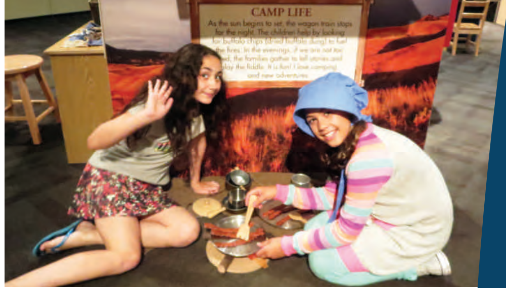
Young explorers enjoy Centuries of Childhood exhibit