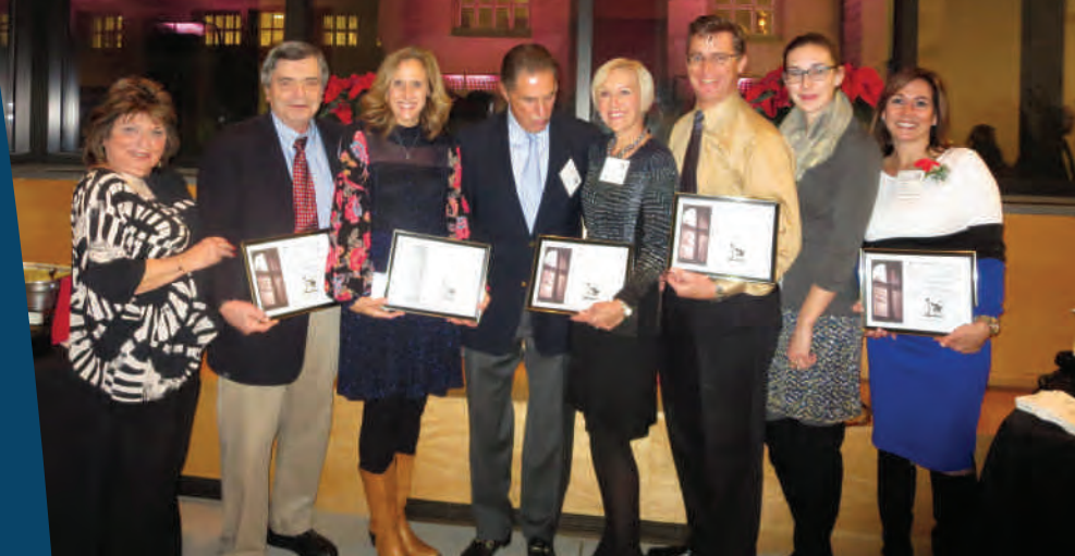
Mercer Rainmakers business members