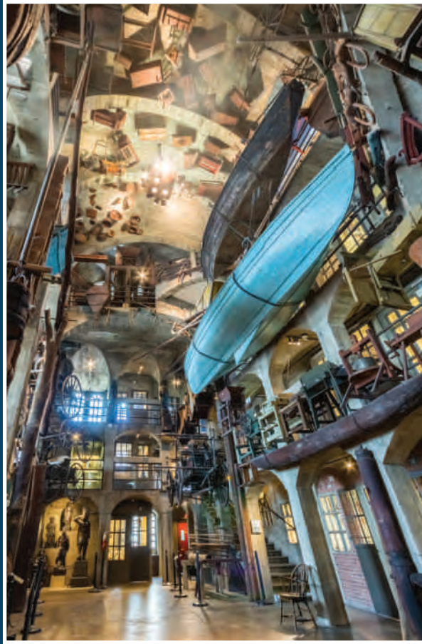
Mercer Museum's iconic Central Court