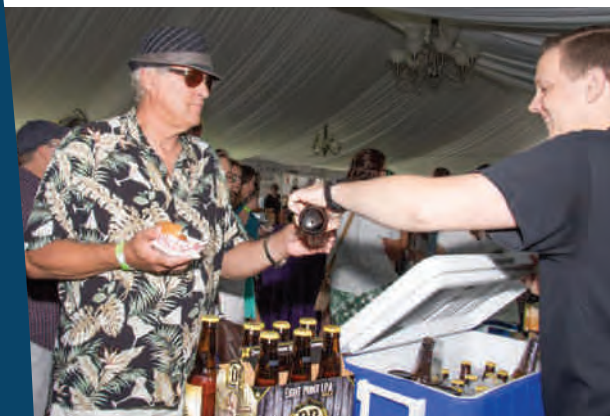
Volunteer serves guest at sold out Beer Fest