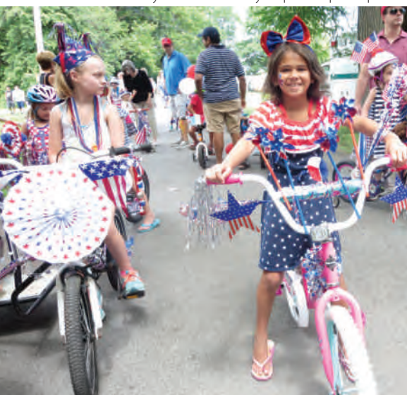
Fonthill's Fourth of July Celebration bicycle parade participants

We apologize for any misspellings or omissions