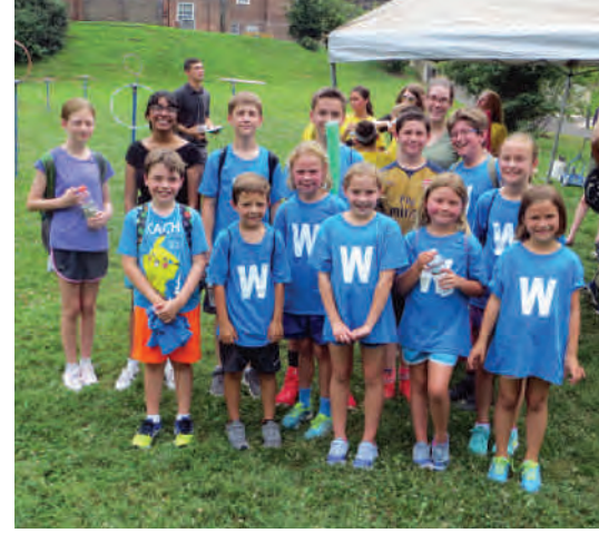
Wizarding camp participants

The Mercer Museum sponsors an array of programs annually for general audiences, including children, youth, and adults. On- and off-site children-focused learning experiences include our popular LEGO™ Robotics and “Wild World of Wizarding” summer camps, the long-running Dolls’ Day Out, the Bucks-Mont Regional History Day competition for middle and high school students, and “Log House Life” for very young children. For adult and general audiences, the museum presents programs in conjunction with African-American History Month, Presidents’ Day, the Halloween season, and the December holidays, plus special tours, workshops and storytelling performances.