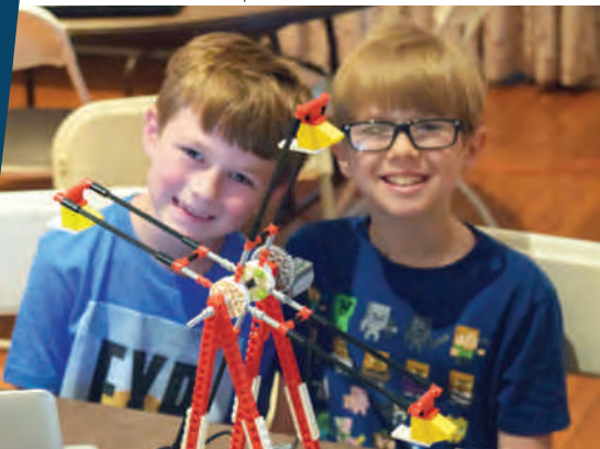
Mercer Robotics' Campers